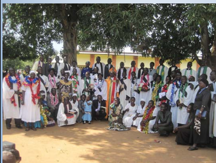
Above - It is a joy to welcome these new leaders to build the body of Christ in our area