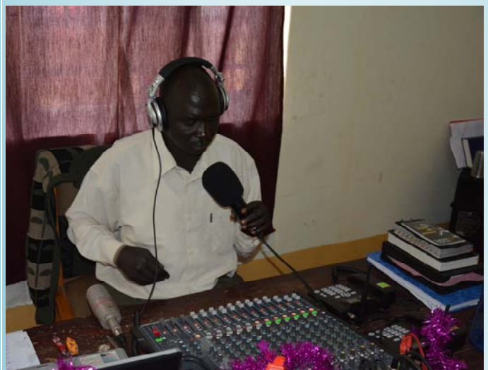
Hope FM Studio