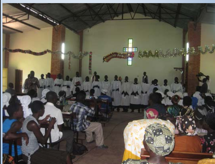
Above - The ordination service took place in the Emmanuel Cathedral in Romogi