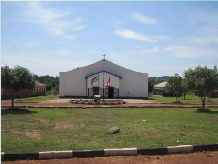
Revival centre in Kajo Keji

In February this year the Revival Movement had their National Convention in Juba. Nearly 28 thousand people from greater Equatoria, Uganda and DR Congo. In the evaluation meeting of the central Revival Movement a decision had been made that the next National Revival Convention would be in Kajo-keji.