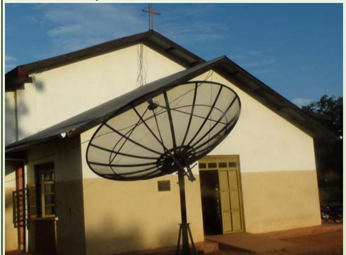
The dish to receive the VOA broadcasting near the Cathedral

Our Diocesan radio station Hope FM is now broadcasting the programs of Voice of America (VoA). In the middle of July the VoA equipment was installed and our listeners have now access to information through the VoA news programs (like: South Sudan in Focus, Day Break Africa, Africa News Tonight and The straight Talk Africa). I thank God that we have now a reliable news source and this will reduce the spread of false information in our community.