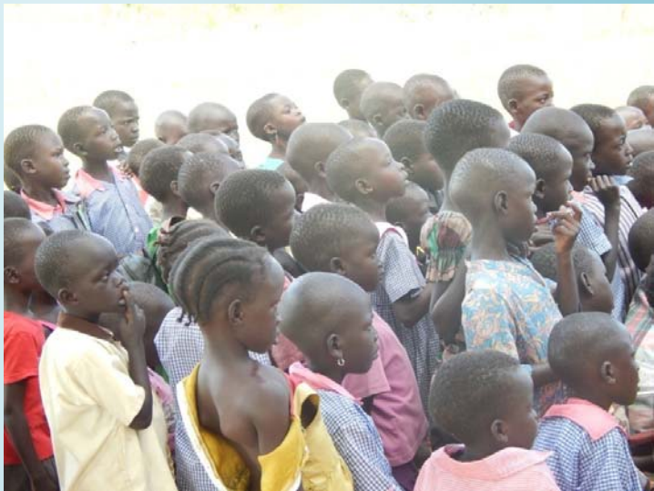
Attentive listeners at a children's club

Many people all over the world ask whether anything good can come from our country, because of these useless wars that have been going on. Also South Sudanese ask every day: