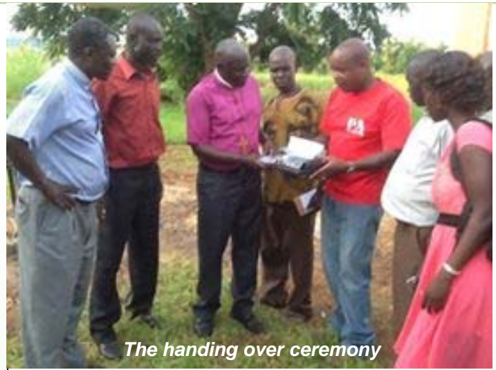
The handing over ceremony

"We want to thank Carlile College, Church Army Africa, our sponsors, our placement churches (St Mary Magdalene and Moru congregation of Mundri and Lui Diocese). Glory and honour be to God. We wish for more students to join this ministry for the purpose of winning souls to Christ and to God's kingdom".